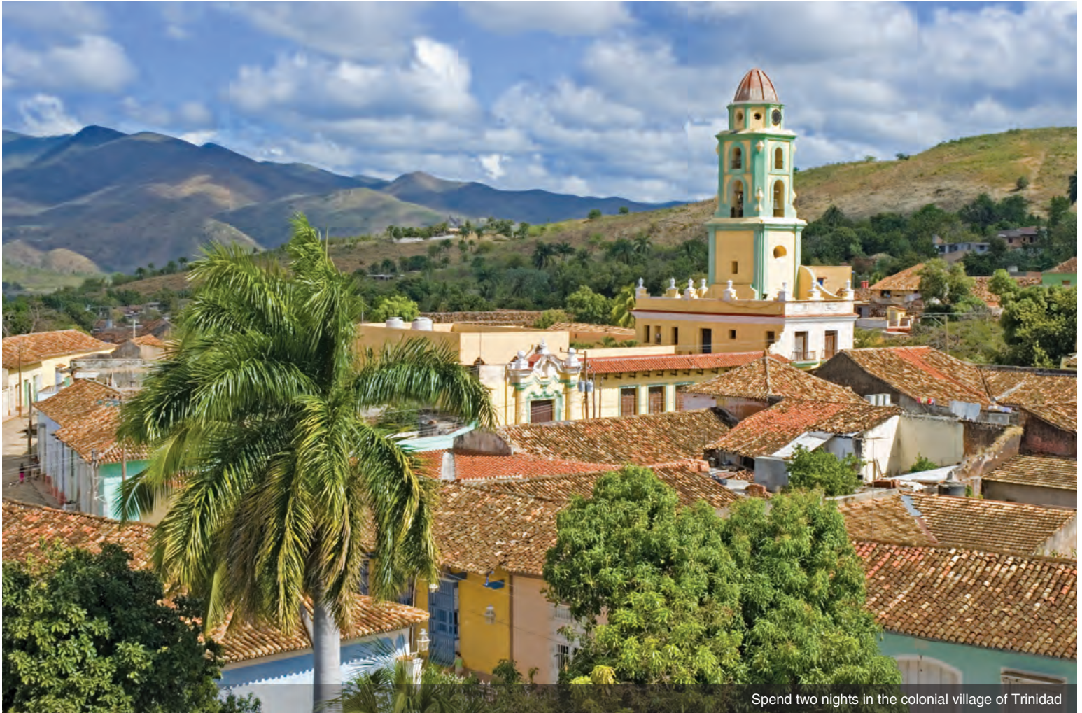
Spend two nights in the colonial village of Trinidad