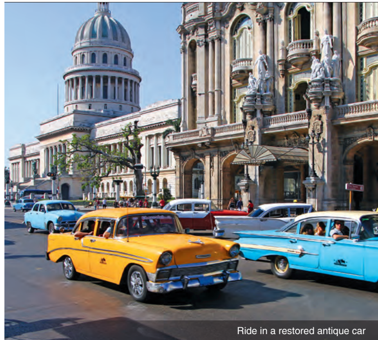
Ride in a restored antique car

Americans can once again travel to Cuba legally and Mayflower Cruises and Tours has planned an amazing trip for you to this country which has previously been 'off-limits'. Our program complies with the OFAC (Office of Foreign Assets Control) regulations for travel-related activities to Cuba and was specifically designed to qualify under the General License "515.574 "Support for the Cuban People". Keeping with the license regulations, the designed itinerary provides a full-time schedule and does not include an excess of free time or recreation. Our journey through Cuba supports individuals and non-governmental organizations that promote travel and independent activities intended to strengthen civil society in Cuba, enhance contact with the Cuban people, support civil society in Cuba, or promote the Cuban people's independence. Our itinerary meets these requirements with the variety of activities we included for you to experience on this educational and interactive program. From the welcoming smile and wealth of knowledge provided by our professional coach drivers and tour guides to the planned visits to historic and cultural areas, meals taking place in local paladars, meetings with tradesmen, artisans, dancers, and other people you'll encounter throughout your stay, your program results in meaningful interaction with individuals in Cuba, thereby promoting the goals of the license and giving you an insightful understanding of the Cuban culture.