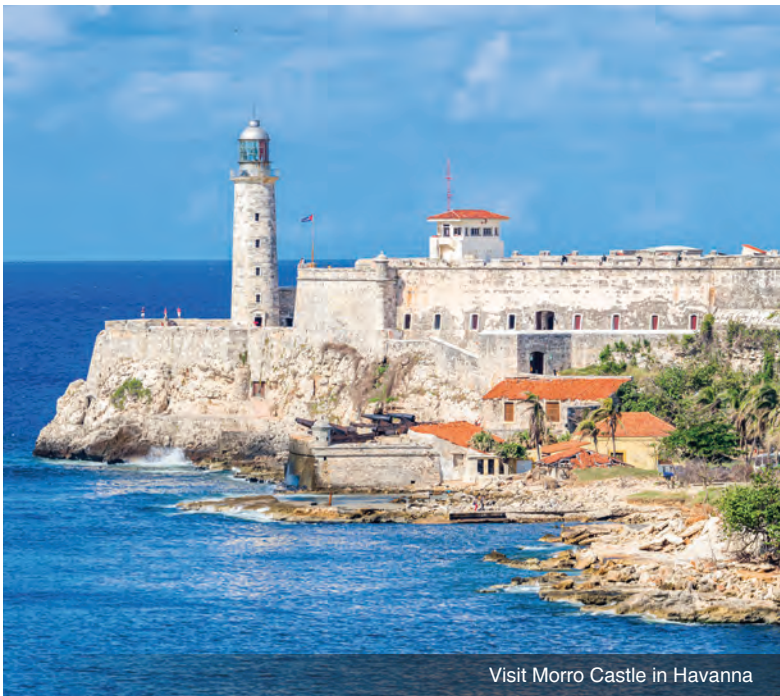
Visit Morro Castle in Havana

such an important role in changing the lives of the children. After lunch at a paladar, attend an interactive and cultural exchange with dancers when visiting a dance studio. Talk with the teacher and students, see how the Cuban Salsa is done, and learn how to do this dance yourself! This evening, dinner is held at a local paladar for your immersion into local culture, dining on local cuisine and mingling with the staff. Meals: B, L, D