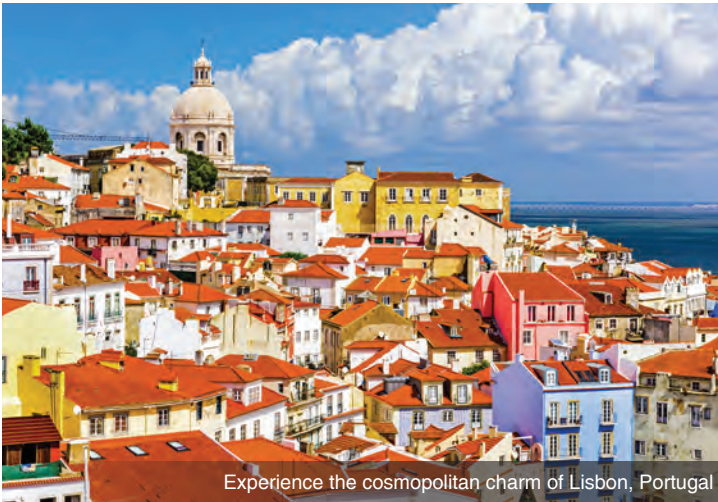
Experience the cosmopolitan charm of Lisbon, Portugal