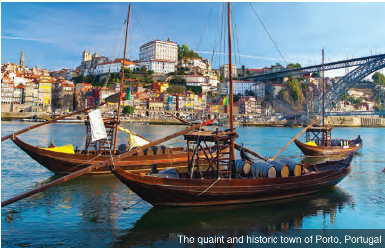
The quaint and historic town of Porto, Portugal

DAY 9 Régua – Lamego: From Régua, journey to the marvelous baroque village of Lamego, home to the Sanctuary of Our Lady of Remedies - one of the most important pilgrimage sites in Portugal. Visit the Sanctuary perched atop the hill, with its iconic 686-step granite staircase, decorated with the traditional Portuguese blue and white ‘azulejos’ tiles. During a guided walk through the village, learn about the importance of wine production to the local area. Return to the ship in Régua after the excursion. Meals: B, L, D