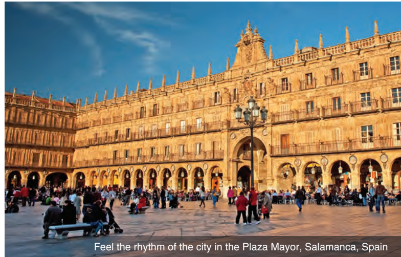
Feel the rhythm of the city in the Plaza Mayor, Salamanca, Spain

DAY 1 Depart the USA: Depart the USA on your overnight flight to Lisbon, Portugal.