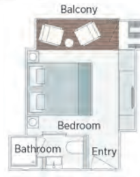
Panorama Balcony Suite