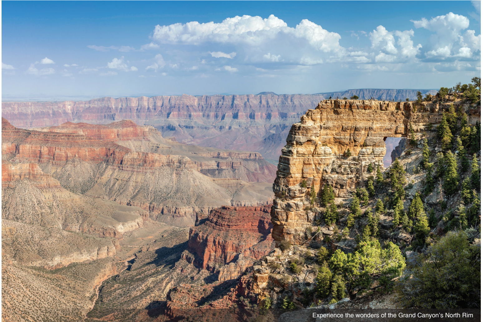
Experience the wonders of the Grand Canyon's North Rim