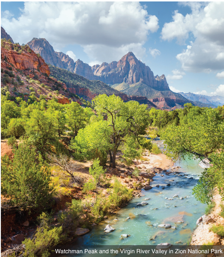
Watchman Peak and the Virgin River Valley in Zion National Park

have been formed by frost weathering and stream erosion of the river and lake bed sedimentary rocks. Meals: B, D