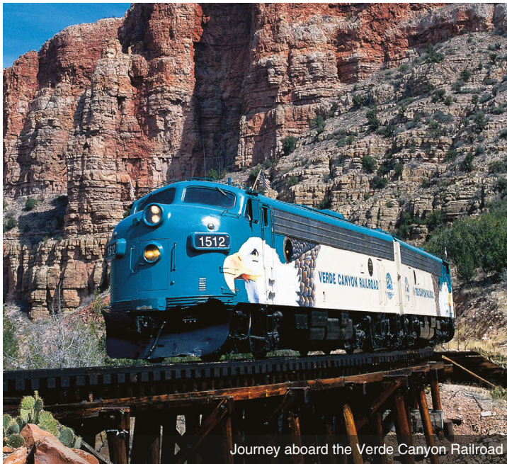
Journey aboard the Verde Canyon Railroad

DAY 5 Verde Canyon Railroad: This morning, stop in Jerome, an old mining town and melting pot for those who dreamed of making a quick fortune. Once virtually a ghost town, it is now restored with shops, museums and art. Later, climb aboard the Verde Canyon Railroad for a spectacular journey over old-fashioned trestles, past ancient Indian ruins and through a 700-foot tunnel. Enjoy the views from the comfort of your First Class seat or from one of the open-air viewing cars. Watch for wildflowers, blooming cacti and wildlife in their natural habitat. Tonight, chow down with a chuckwagon supper at the “Blazin’ M Ranch” and Western Stage Show. Meals: B, D